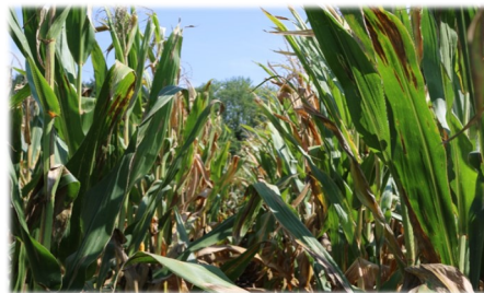
Trivapro® 13.7 fl oz/A at VT