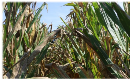
Delaro® 8 fl oz/A at VT