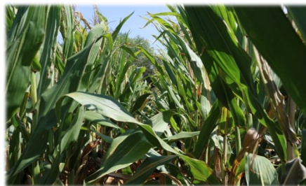
Veltyma™ 7 fl oz/A at VT